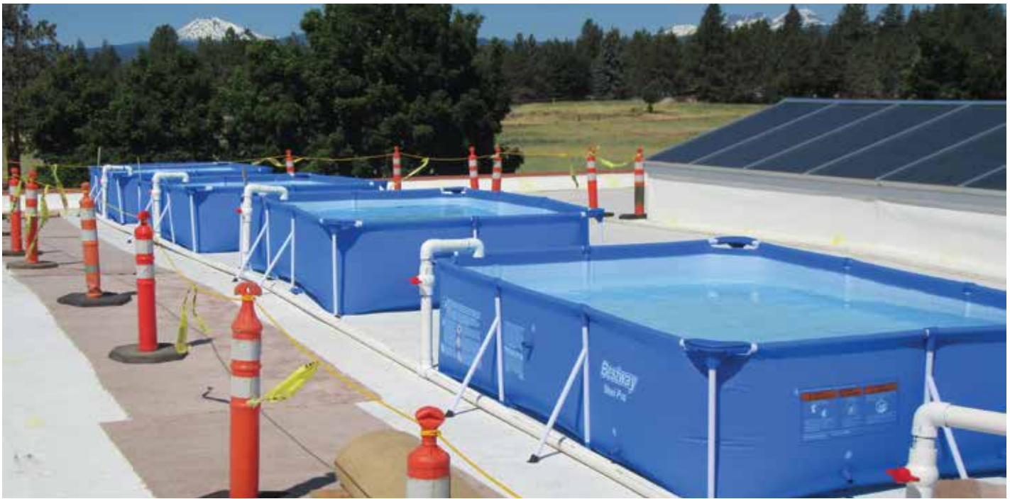
Pools filled with water on the roof during load test of the repaired truss.

to be equal to the snow load (30,453 pounds) plus removed ceiling tiles and their metal support grid (1,493 pounds) minus the pool self-weight (215 pounds). The total weight of the created load was 31,731 pounds, which equates to 3,805 gallons of water.