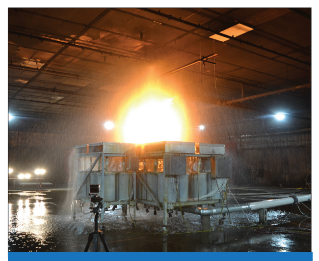
This project was unique due to the innovative use of the actual delivered density apparatus as a scoping tool for full-scale testing, which provides a methodology to identify trends and identify scenarios that may pass or fail the selected performance criteria.

The chords are constructed of two L-shaped members, welded or bolted together back to back. In addition, the