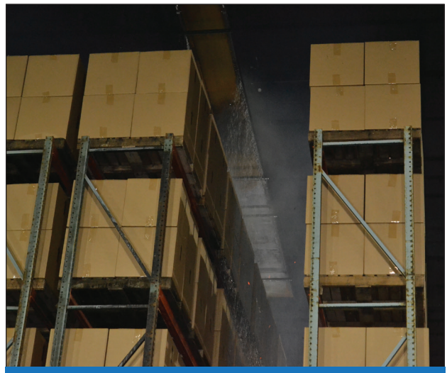
The use of K14 sprinklers was initially discounted given the recent controversy regarding the adequacy of K14 sprinklers to protect rack arrays of Group A plastic beneath a 40-foot ceiling. However, the extensive legacy use of the K14 sprinkler prompted the exploration of its performance in Phase 4.

performance in Phase 4. A total of 20 ADD tests were