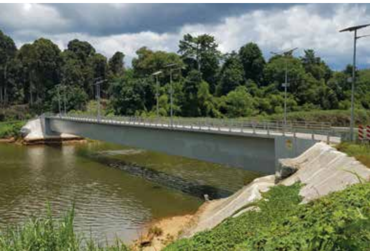
328-foot (100-meter) Single Span BATU 6 UHPC Bridge Perak, Malaysia, produced at Dura Technology.

Production of precast UHPC elements can be accomplished using most of the equipment already used for conventional precast production. Just about any type of mixer can produce UHPC – even a mixing truck – given enough mixing time. However,