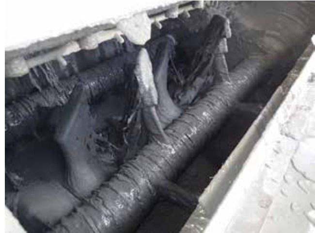
Producing UHPC in a precaster's mixer.

Several concrete precasters have demonstrated that UHPC mixtures can also be produced using many of the materials already used for conventional concrete production. In general, a