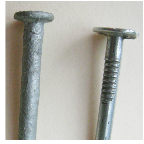
The nail on the left is double hot-dipped galvanized. The nail on the right is electroplated.

Not sure what you're looking at on a job site? Take a close look. Electroplated and hot-dipped galvanized nails are very different in appearance (photo to right). Electroplated nails are shiny and relatively smooth, whereas hot-dipped galvanized nails are dull gray and have a slightly rough surface texture.