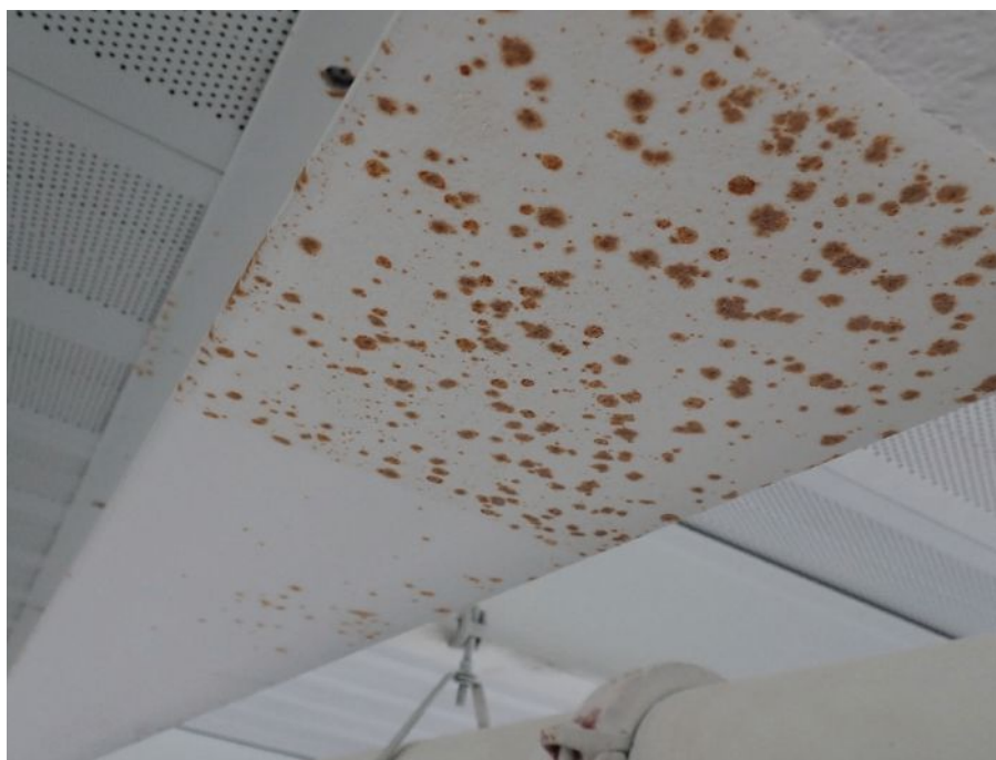
FIGURE 2 Representative area of medium-dense staining at bottom flange.

tions of paper towels with spots of reddish-brown stain, and Samples C1 through C3 represented “control” samples from portions of the paper towel without an apparent stain. Samples 1, 3, and C2 were arbitrarily