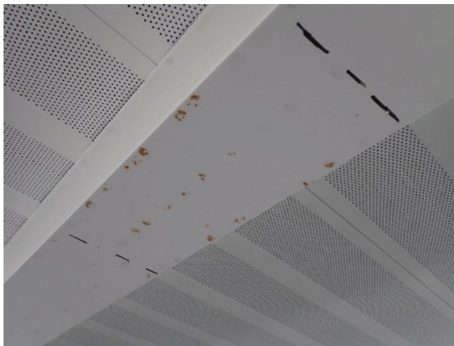
FIGURE 3 Staining after moisture testing.