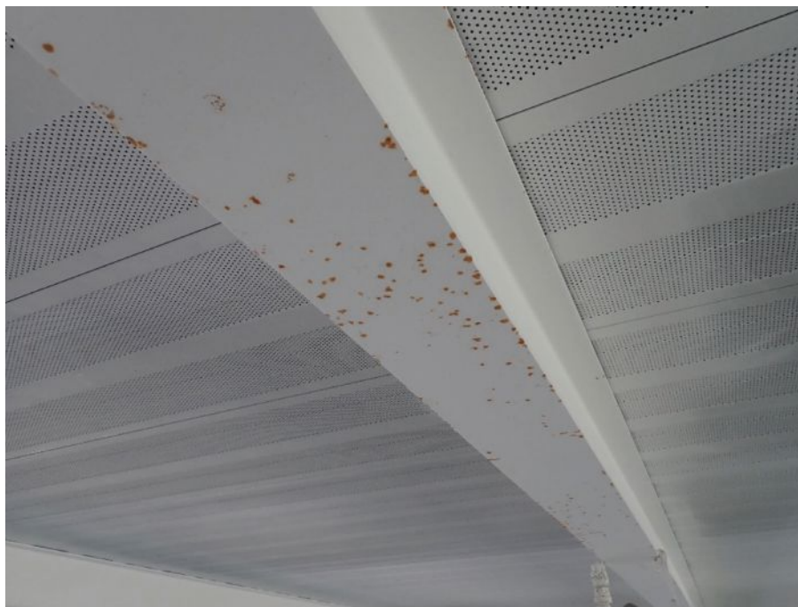
FIGURE 1 Representative steel framing member exhibiting staining of the topcoat.

Six portions of paper towel samples were collected during the on-site moisture testing. Samples 1 through 3 represented por-